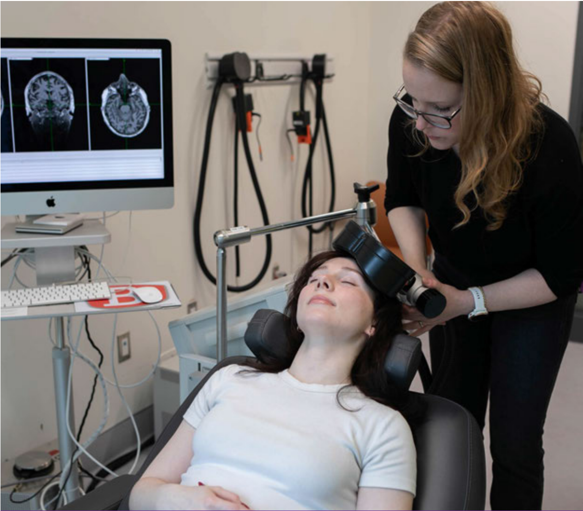
A technician delivers rTMS at CAMH’s Temerty Centre for Therapeutic Brain Intervention.