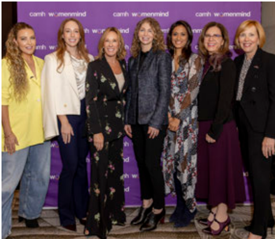
CAMH womenmind ™ International Women's Day event, March 2025

This year, the CAMH community came together in many ways—rising with the sun, walking the runway or lighting up the holiday season to name a few. We are proud to move forward together to a future where no one is left behind.