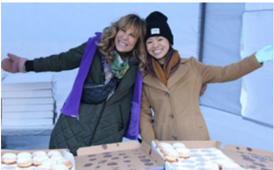
Gifts of Light Holiday Tree Lighting, November 2024