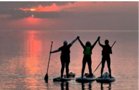
CAMH Sunrise Challenge, June 2025