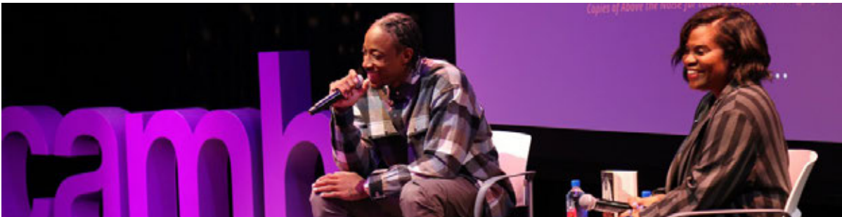
Above the Noise , featuring NBA All-Star DeMar DeRozan and former Minister for Women and Gender Equality and Youth Marci Ien, created space for youth and families to speak honestly about depression, stigma and resilience.