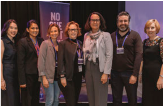
CAMH Business Leaders for Mental Health Symposium, October 2024