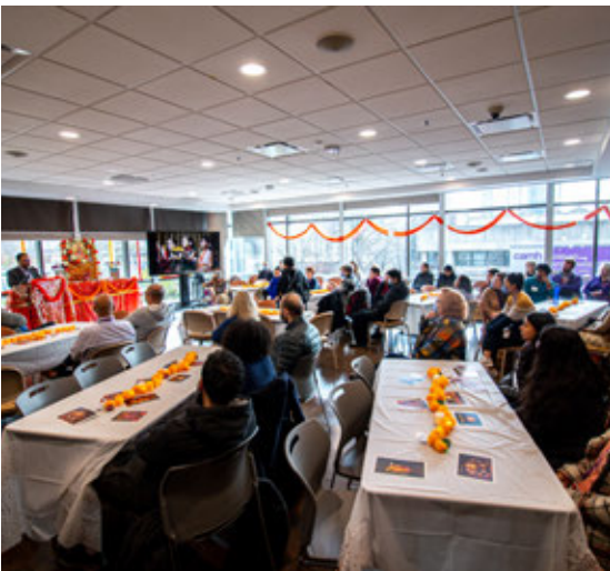
Diwali celebrations, November 2024