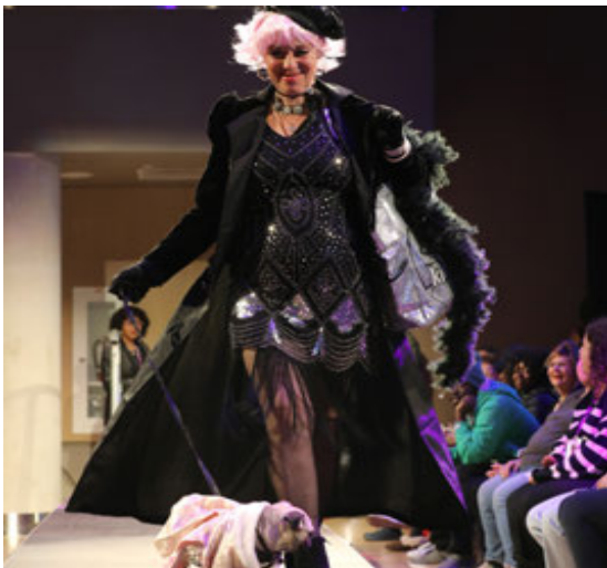
Suits Me Fashion Show, October 2024