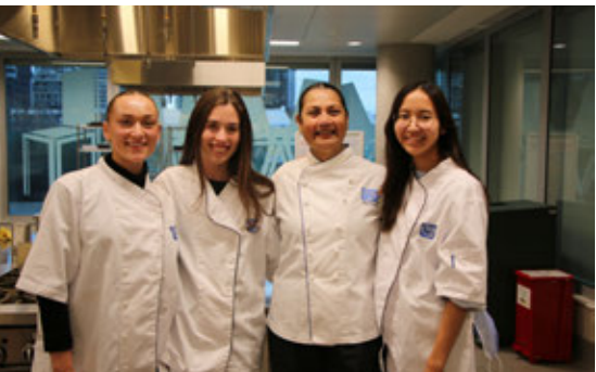
CAMH Culinary Program Graduation, December 2024