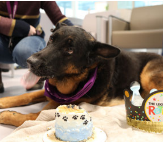
CAMH Pet Therapy Program, year-round