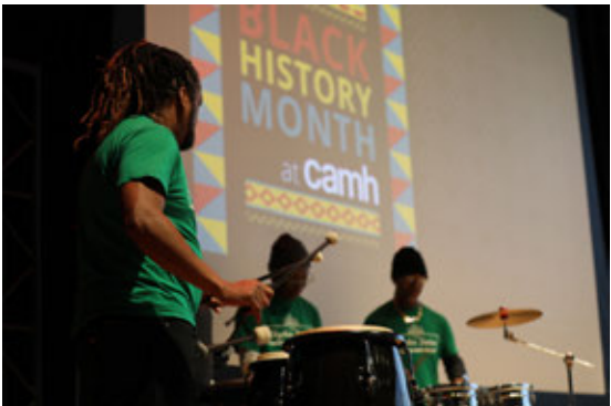
Black History Month celebrations, February 2025