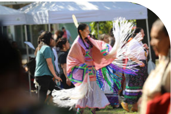
CAMH Pow Wow, September 2024